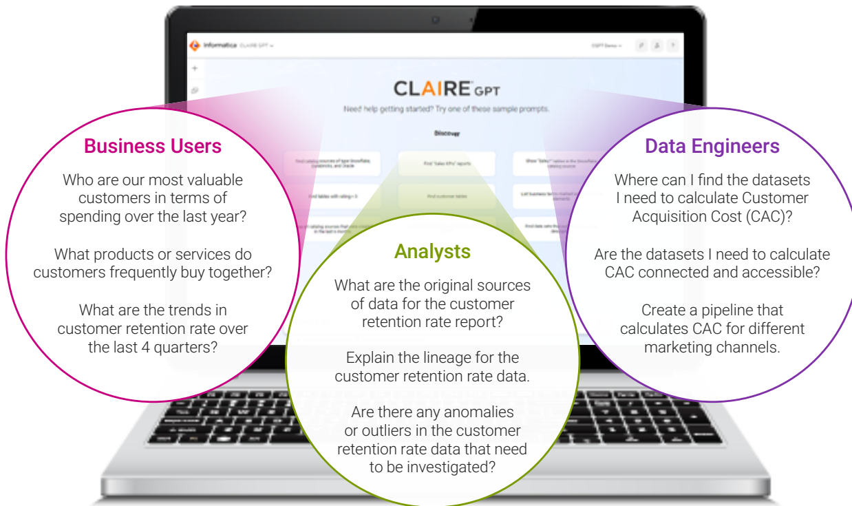
Figure 1. CLAIRE GPT natural language interface across the Informatica Intelligent Data Management Cloud (IDMC) services

Search and discover data assets available in the data catalog through a natural language interface powered by Informatica’s large language model (LLM). CLAIRE GPT helps simplify, accelerate and optimize data management operations, driving enormous gains in productivity for data teams. See Figure 1.