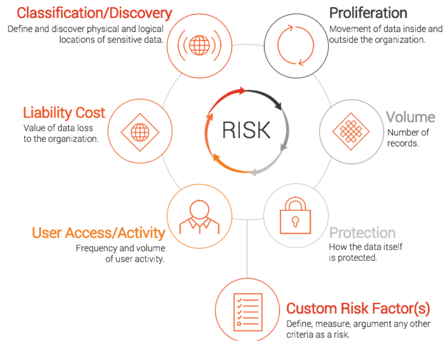
Figure 2: Risk analytics achieve highest accuracy when a solution can continuously discover and classify sensitive data and where it proliferates, scale for data growth, apply protection methods at the data level, incorporate custom risk criteria, monitor and track user behavior, and generate estimated costs of data loss.