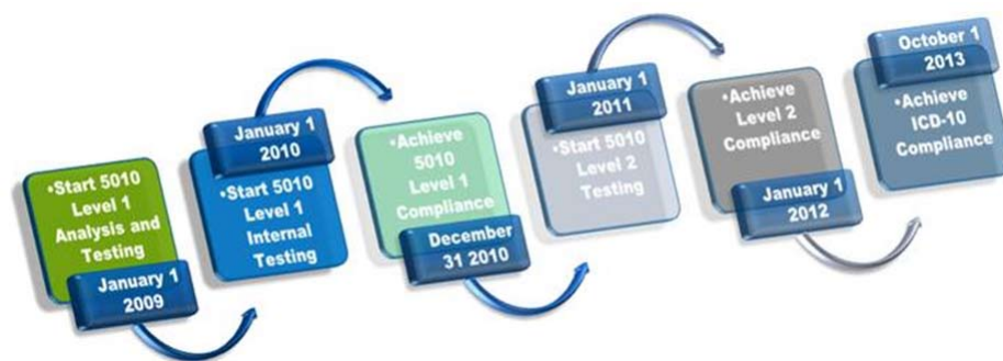
Figure 1. The timeline for adopting HIPAA 5010A.

This latest version overcomes many of the limitations of the regulation's earlier versions. It also represents an opportunity for healthcare plans to move beyond HIPAA as simply a compliance challenge and begin to derive business efficiencies from enhanced B2B integration with trading partners. The legislation became effective on January 1, 2011, and it accommodates a one-year testing period in which organizations such as Availity must continue business operations with 4010 and also test the new 5010A format. As of January 2012, they must then adapt and comply fully with the more rigorous HIPAA 5010A format.